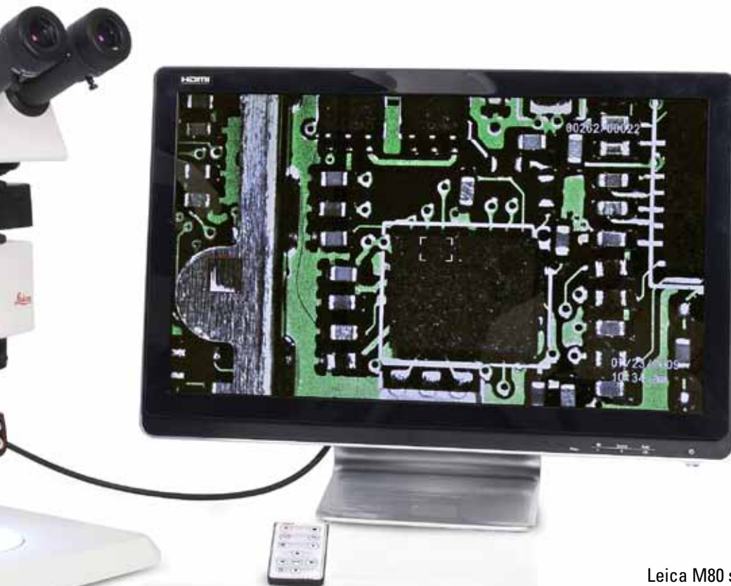
Leica M80 stereomicroscope with integrated Leica IC80 HD camera, HD RC remote control, LED3000 NVI illumination, ErgoTube, and full HD monitor.

Convenient Camera Control: The infrared (IR) remote control unit provides convenient control of camera settings including white balance, brightness, and image contrast. As needed, the user can rotate the live image 180° or pause for visual inspection using the binocular tube or monitor. At the push of a button on the remote control, movie clips can be recorded directly to an SD card for fast documentation or training purposes.