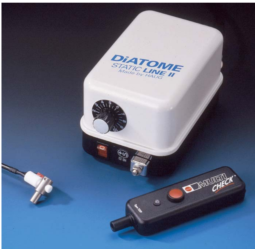
"STATIC LINE II" ionizer with powerpack and "MULTI CHECK" control unit.