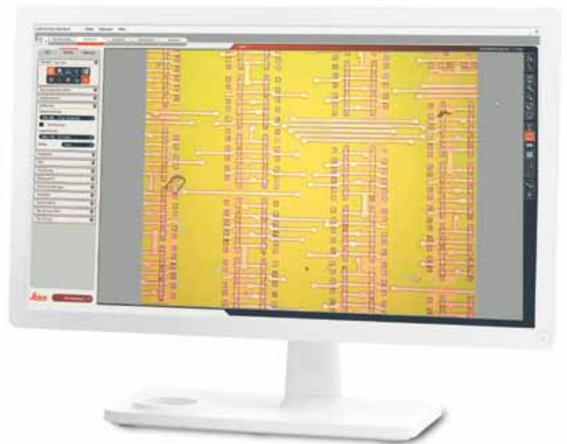
Leica DM8000 M with Leica DFC450 digital microscope camera and PC system with Leica LAS software